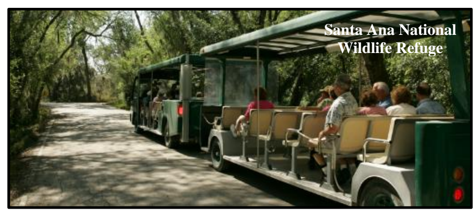
For more information visit the website - fws.gov/refuge/santa-ana

Take the Nature Tram for a lively Introduction to Santa Ana National Wildlife Refuge and the history of the lower Rio Grande Valley. The comfortable, open-air tram traverses the 7-mile wildlife drive in an hour and a half. It is led by knowledgeable guides and includes a stop at the historic cemetery and a view of the Rio Grande River.